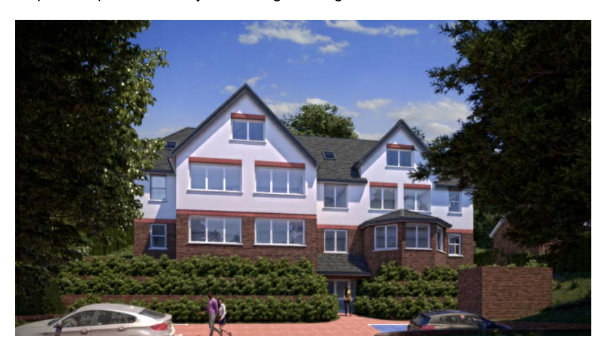
Fig 4: CGI of site showing front elevation of proposal

8.14 The application site is a substantial plot within an established residential area and is comparable in size to other flatted and neighbouring back-land developments approved throughout the borough. As with these previous schemes, the scale and massing of the new build would generally be in keeping with the overall scale of development found in the immediate area and the layout of the development would respect the pattern and rhythm of neighbouring area.