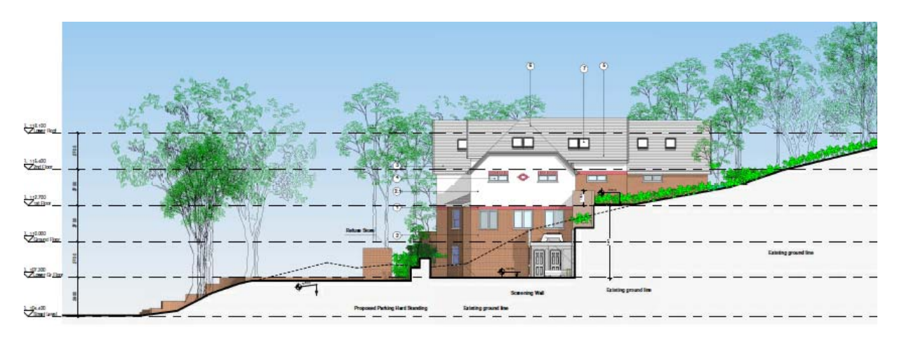
Fig 5: Side elevation highlighting the change in levels

8.16 Policy DM10.6 states that the Council will not support development proposals which would have adverse effects on the amenities of adjoining or nearby properties or have an unacceptable impact on the surrounding area. This can include a loss of privacy, a loss of natural light, a loss of outlook or the creation of a sense of enclosure. The properties that are most affected are the adjoining properties at 30 and 34 Welcomes Road, the properties to the rear (22 Welcomes Road and 5 and 7 Abbots Lane) and properties situated on the opposite side of Welcomes Road (25 and 27 Welcomes Road).