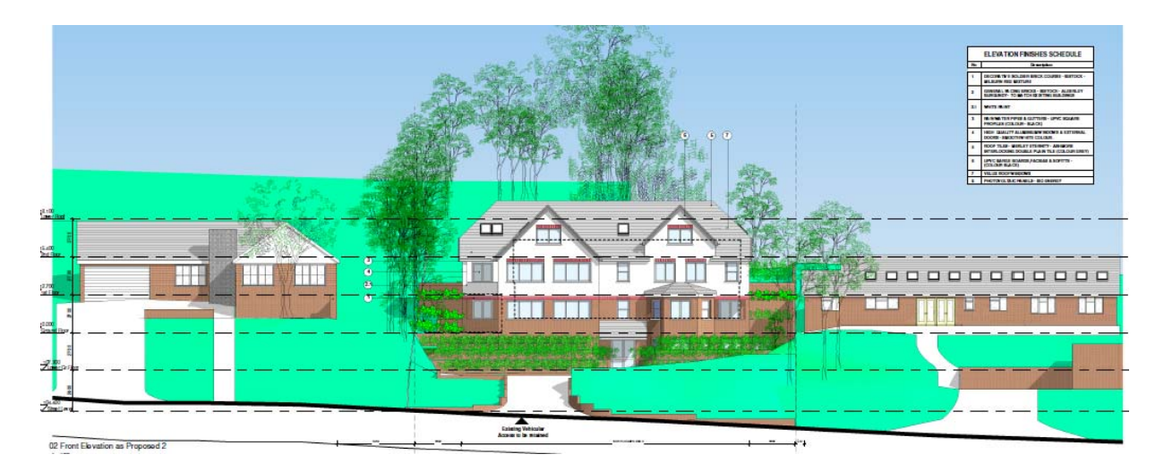
Fig 2: Elevational view highlighting the proposal in relation to neighbouring properties