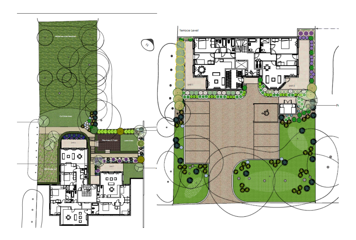
Fig 7: Extracts from submitted landscaping scheme