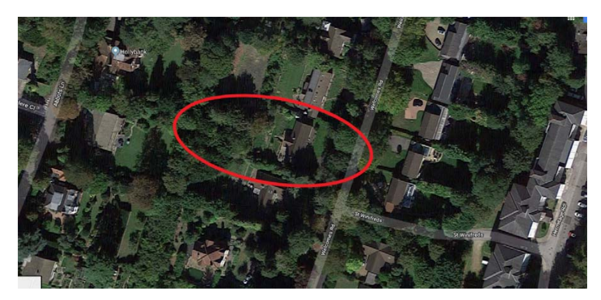
Fig 1: Aerial street view highlighting the proposed site within the surrounding street-scene